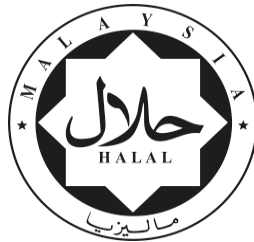
Figure 1: JAKIM Malaysia Halal Food Certification

In accordance to the general guideline to confer the Halal certificate to the food producer, there are few critical areas have been underlined by Malaysian Islamic Development Department (JAKIM) (Manual Procedure JAKIM, 2015). Among those are:-